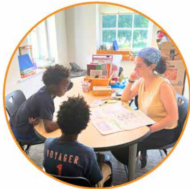
Horizons students, on average, gain 6-10 weeks in reading and math each summer.